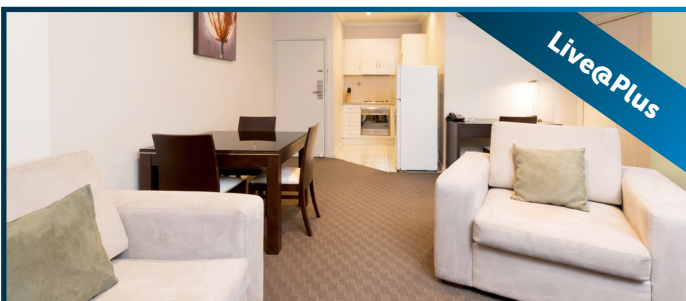
Mantra on Frome Adelaide, SA

Conveniently located in East Perth, Mantra on Hay offers spacious and well-appointed accommodation within easy reach of premier shopping, dining and entertainment.