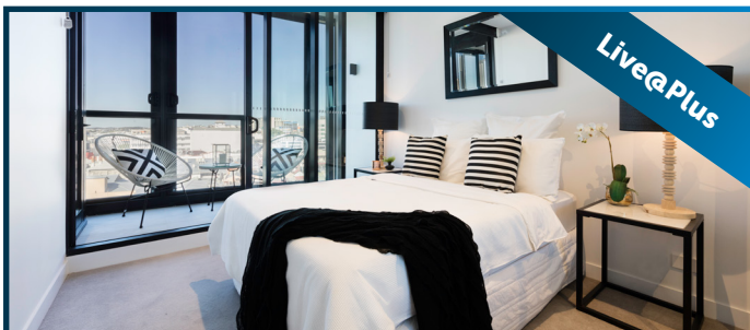
FV by Peppers Brisbane, QLD

From $899* per week in a One Bedroom Apartment